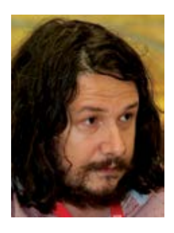
Muharem Bazdulj Serbia